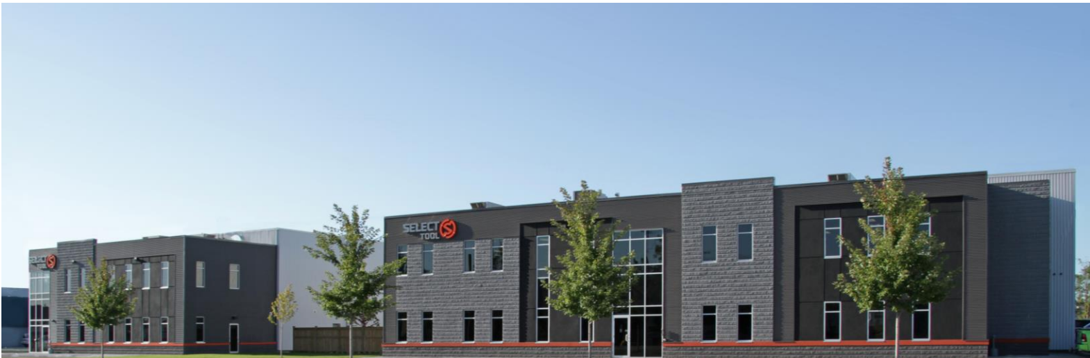
Sample Rosati Design-Build